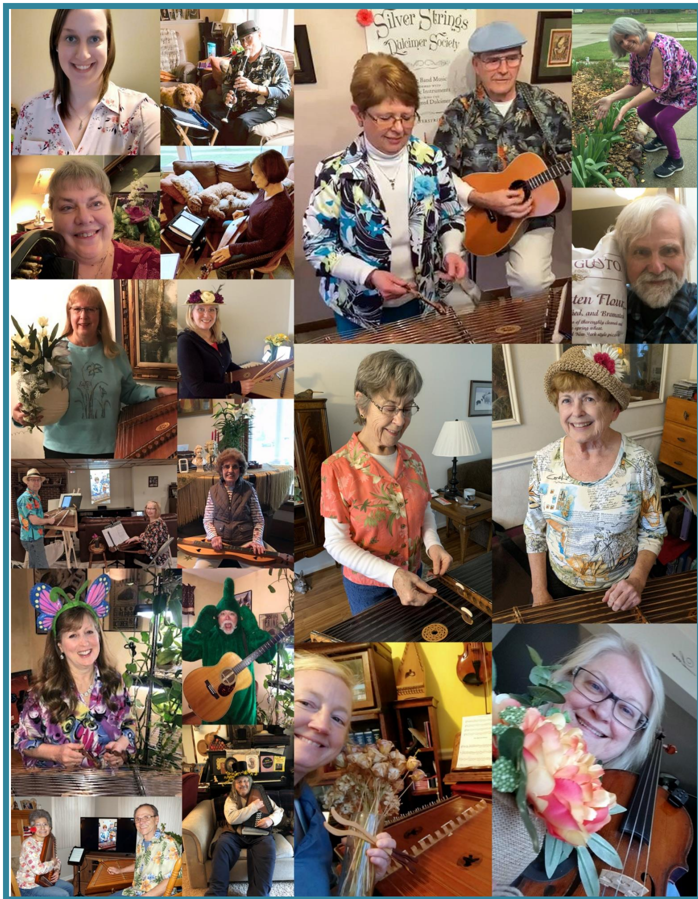
Here is the 19 folks who sent in their "Flowers" theme photos for the April 23 rd Spirit Jam.