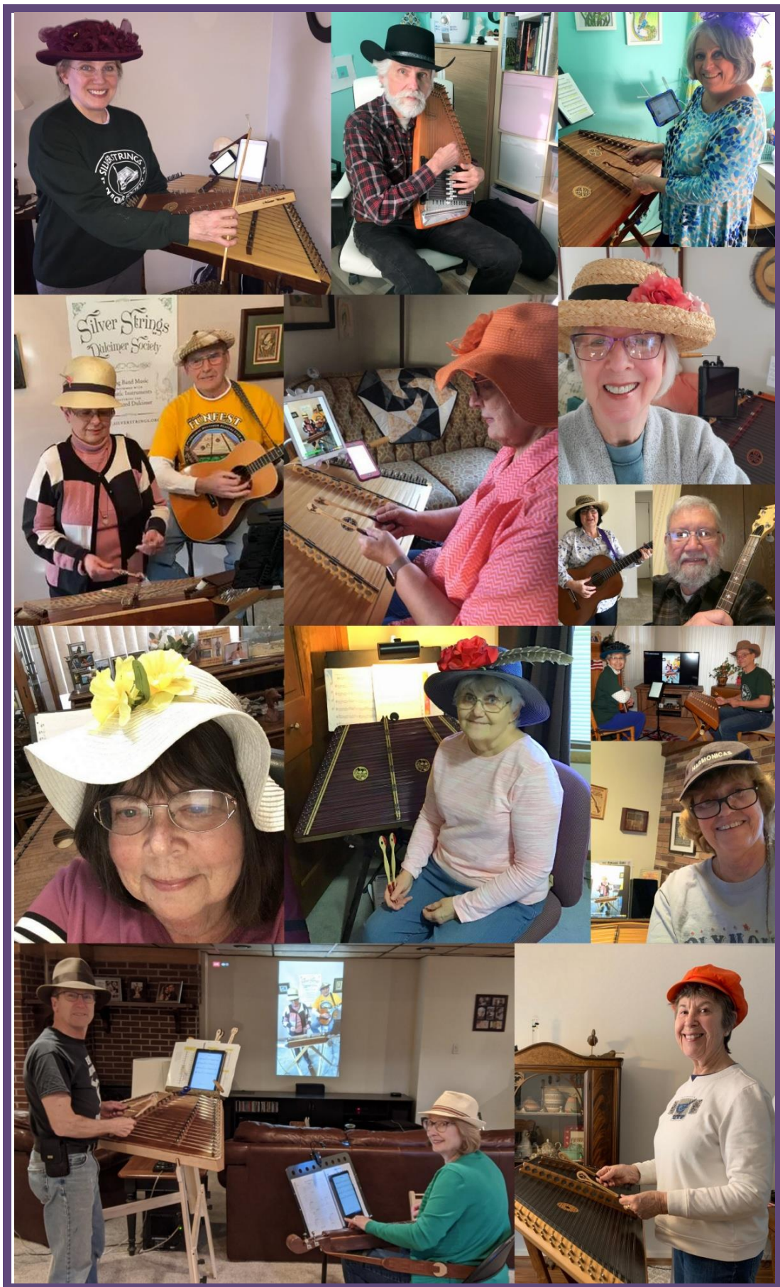
'Wear a hat' was the theme at our April 16 th Spirit Jam. What fun!