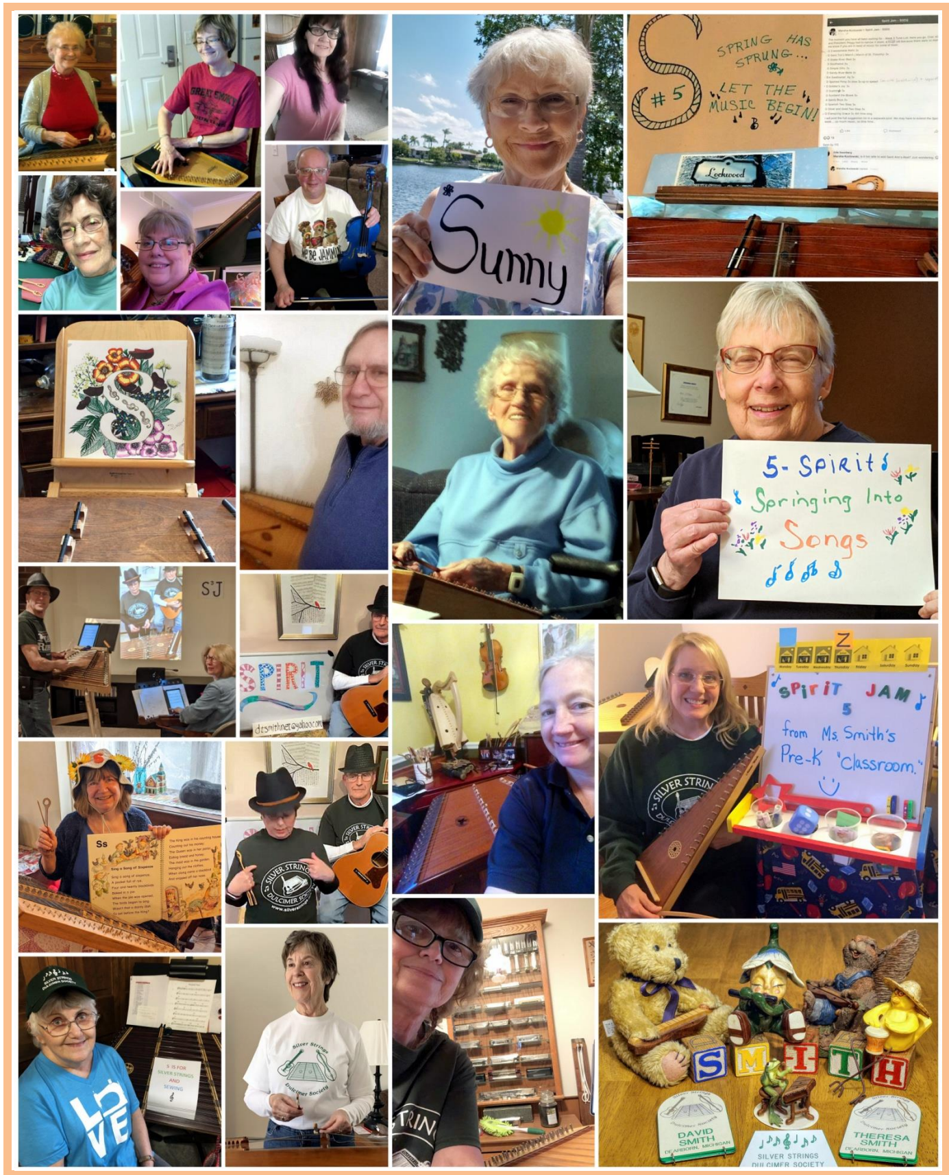
The theme for April 30 th Spirit Jam was 'begins with S'. All tunes began with 'S' and everyone was encouraged to post 'S' themed photos. Another fun jam and encouraging photos. What fun and enjoyment we have sharing it all with our musical friends.