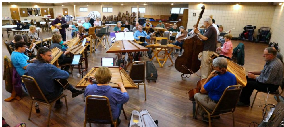
On September 28th Silver Strings hosted the ODPC (Original Dulcimer Players Club) jam at Holy Cross. We had a fun afternoon of jamming and socializing with other players from around Michigan.