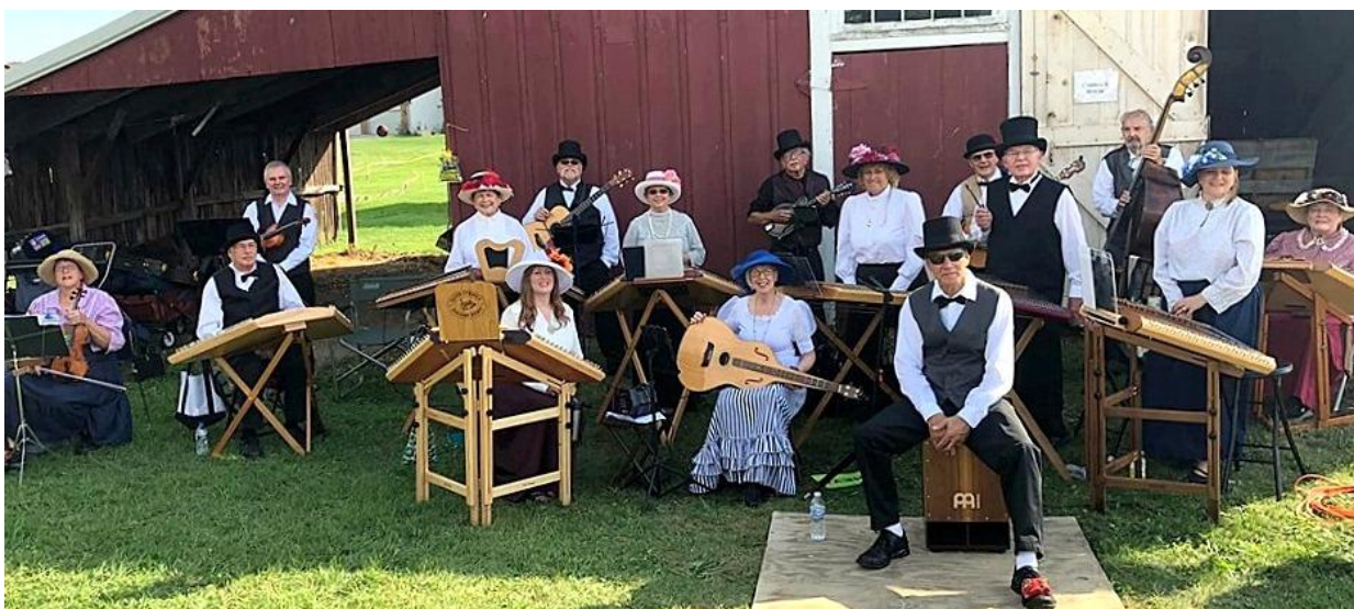
A well dressed band of 16 Silver Strings entertained at the Pittsfield Harvest Festival on September 22 nd