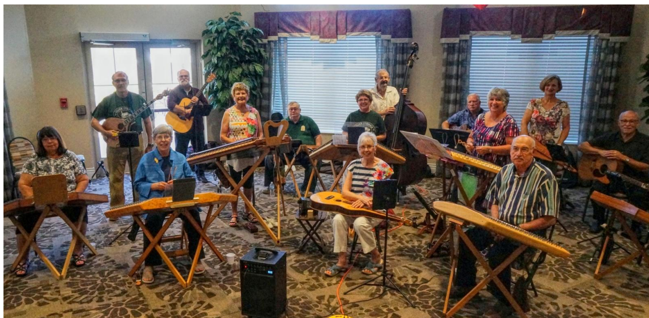
15 Silver Strings members delighted the full house of residents at Cedarbrook Senior Living on September 20th