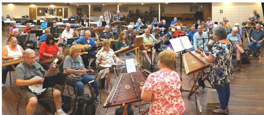
Another really big jam on September 19th at Holy Cross brought out 51 musicians. What fun we had!