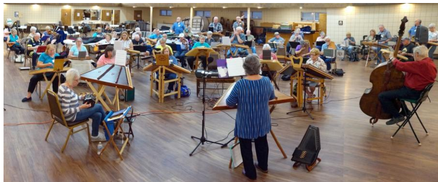
September 3 rd Jam at Holy Cross Church brought 50 musicians together for a fun evening of music and socializing.