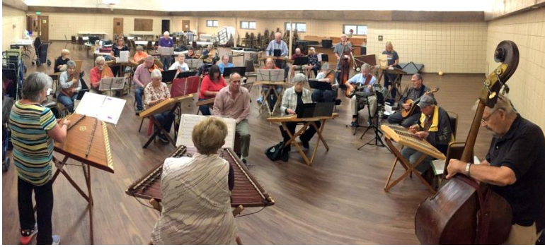
A well attended Christmas practice on October 10