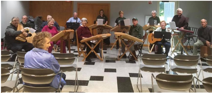
Library Outreach at Salem/South Lyon Library on October 13