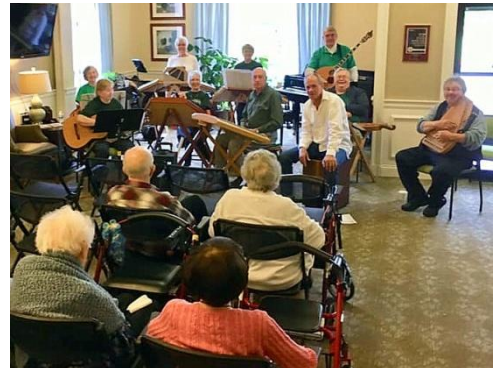
Brookhaven Manor in Ann Arbor Oct. 17