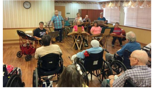
Heartland Healthcare in Canton on October 1