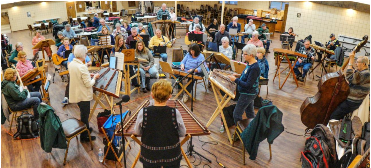
39 musicians attended our April 4th Jam