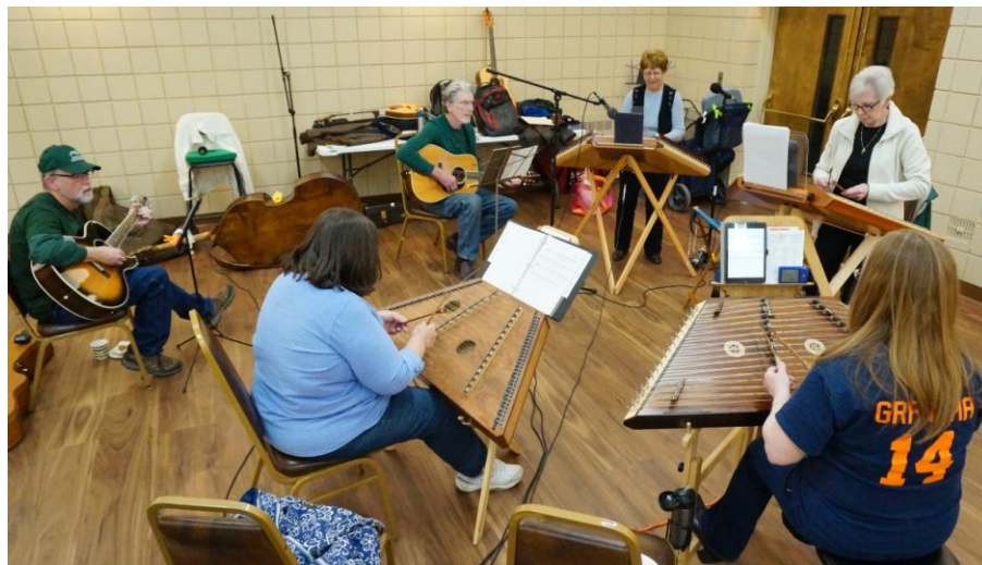
After our regular jam, the "After Hours Jam" starts up at about 9 pm