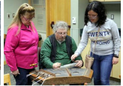
Silver Strings completed another "Library Outreach Program" at the Northville Library on May 6th, performing a mini concert, Q & A, and hands on Hammered Dulcimer lessons for audience participants.