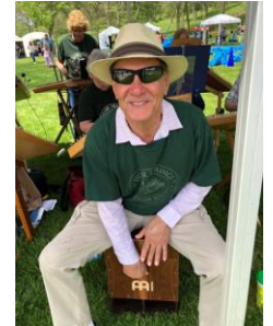
An outdoor performance for the "Integrity Art Show" took place at Kensington Metropark on May 25 th. The weather report was chancy, but fortunately the rain held out until the end of the day.