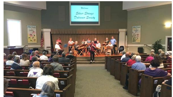
On May 19 th, 12 Silver Stringers made the long drive to the Commerce United Methodist Church. The concert was well received by an enthusiastic audience.