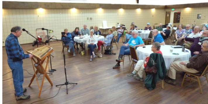
Our first "Variety Night" of 2019 took place on May 30 th . We had pizza, salad, yummy desserts and were notably entertained by a potpourri of 11 different acts. Our next Variety Night will take place on August 29 th .