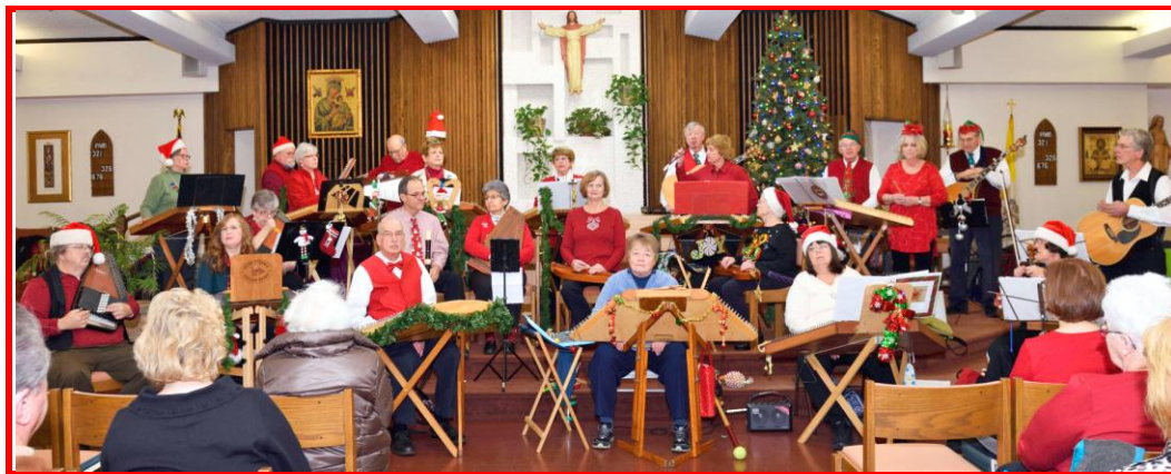
St. Richards Catholic Church December 9th