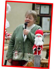
The last of our 14 Christmas Concerts at the well attended Livonia Civic Library on December 20th