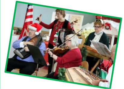
Franklin Community Church December 16th