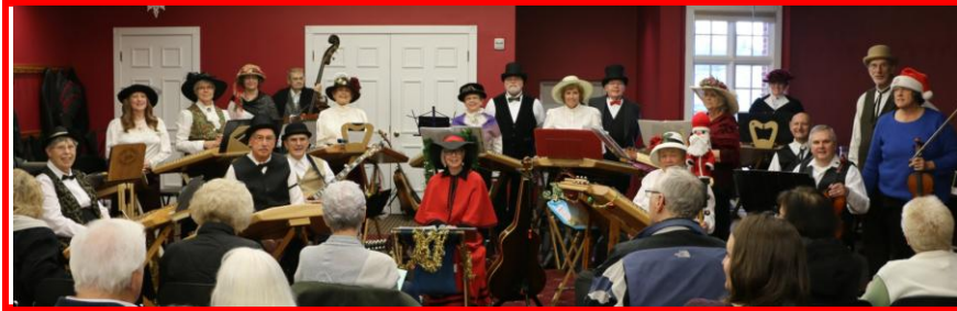
Plymouth Library December 2nd