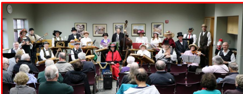
Northville Public Library December 15th