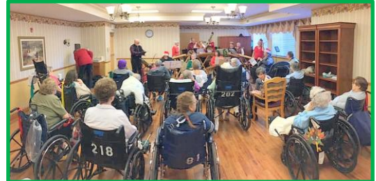
Heartland Rehab Center in Canton December 4th