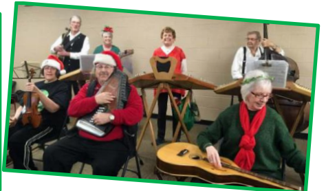
Southgate Veteran's Memorial Library December 12th