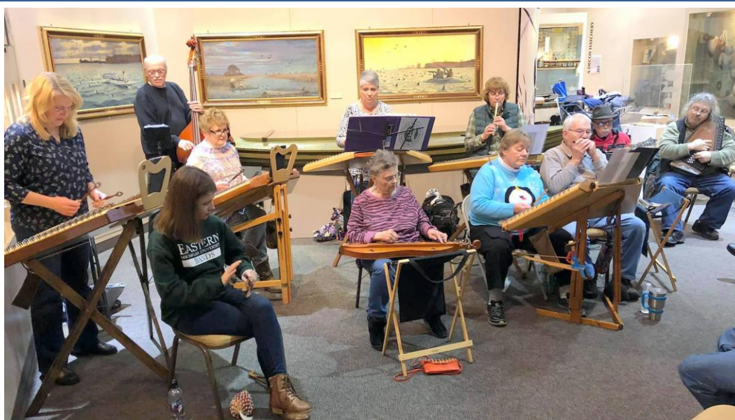
Silver Strings provided musical entertainment at Erie Metropark's Marshland Museum for "Erie Ice Days" on January 19 & 20. They were greeted with snow and cold weather and performed 8 hours over the 2 day event. Wow!