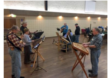
The "After Hours" jams continued after the regular jam.