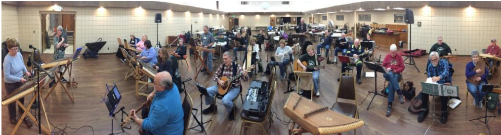
29 members took part in our November 21st jam.