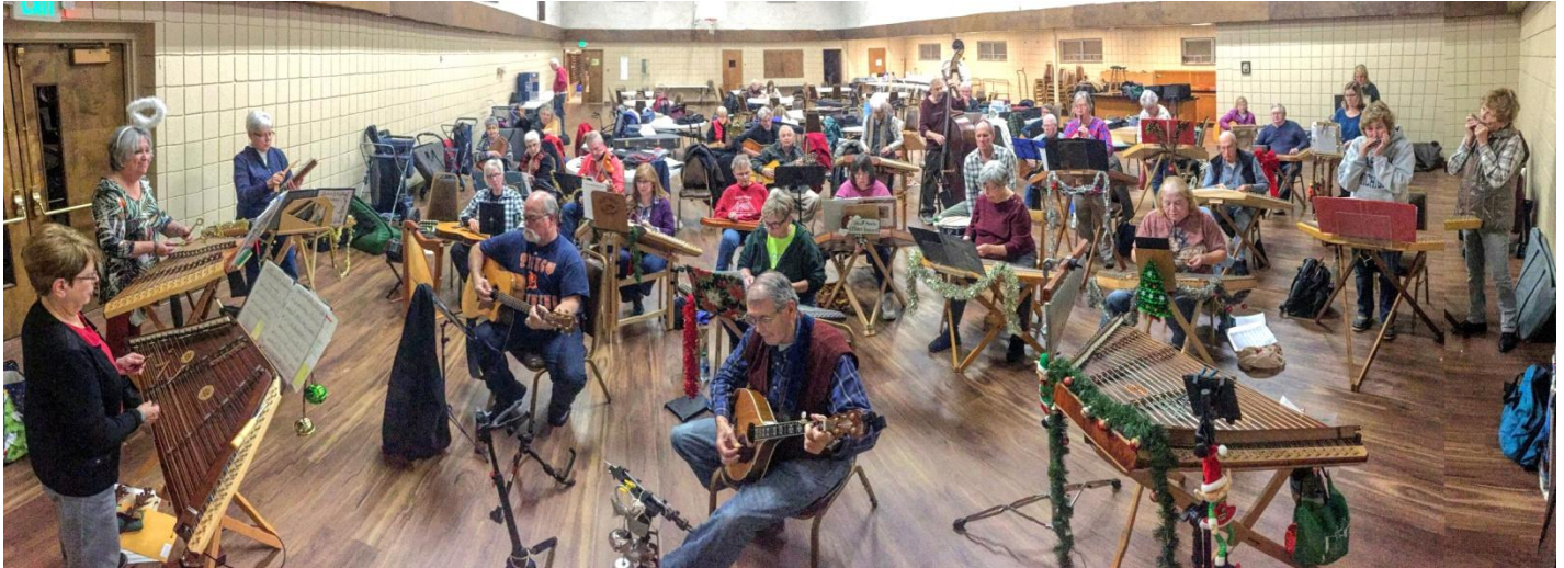
A well attended 3 rd and final Holiday Practice took place on November 14 th . 37 members were ready to celebrate the Holiday Season.