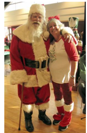
Our first Christmas Concert of the season took place at the "Festival of Trees" fundraiser for the Children's Hospital of Michigan Foundation. We were expecting to be background music, but so many interested in our music that chairs were set up for the interested and appreciative audience. 23 of our Silver Stringers filled and overflowed the nicely decorated stage. Next up in December are 15 more concerts..... Christmas Season here we come!