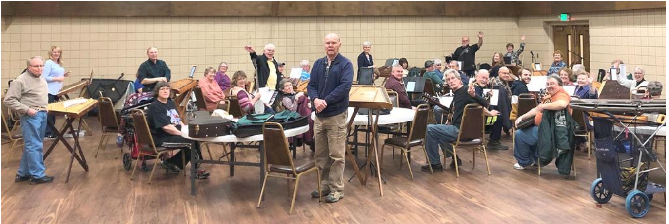
35 members pose for a photo at our well attended Jam at Holy Cross Church on March 21st.