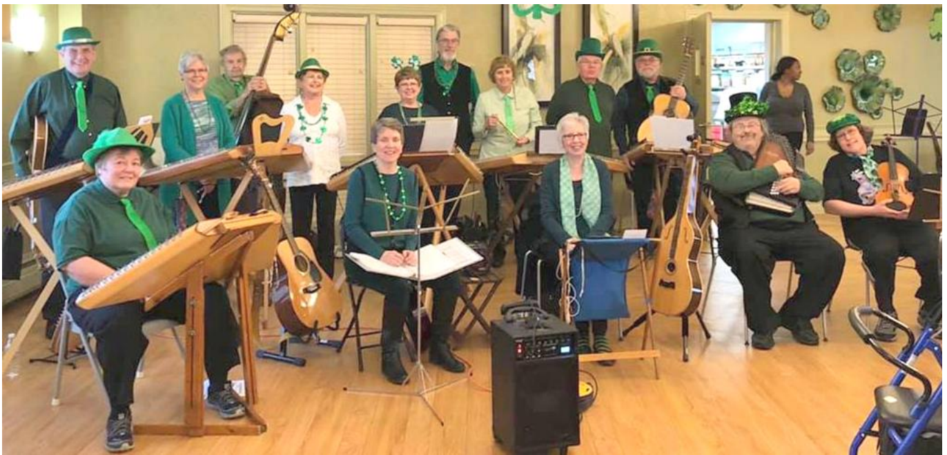
14 Silver Stringers, all in green, gave a lively Irish performance at Oakmont Senior Living in Livonia on March 15th.