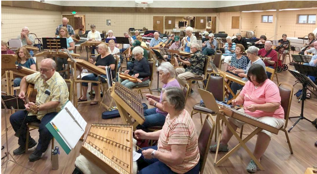
A well attended jam on September 6 th