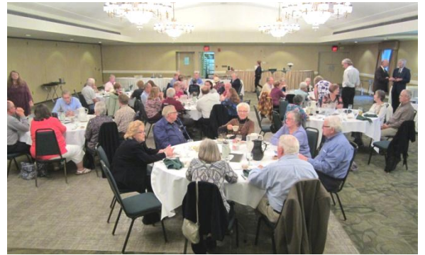
50+ members & guests shared memories, food and music