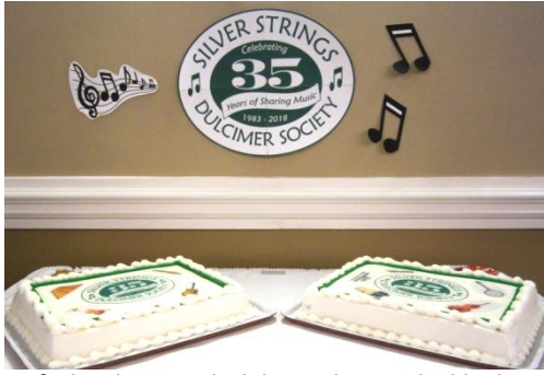
35th cakes, musical decorations and table decorations adorned the hall

35 years of music, fellowship and fun were celebrated at the Hellenic Cultural Center in Westland