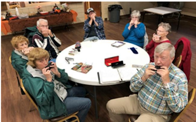
The " Heavy Breathers " Harmonica Jam will meet on November 15 at 6:00 pm (one hour before our regular Silver Strings jam).