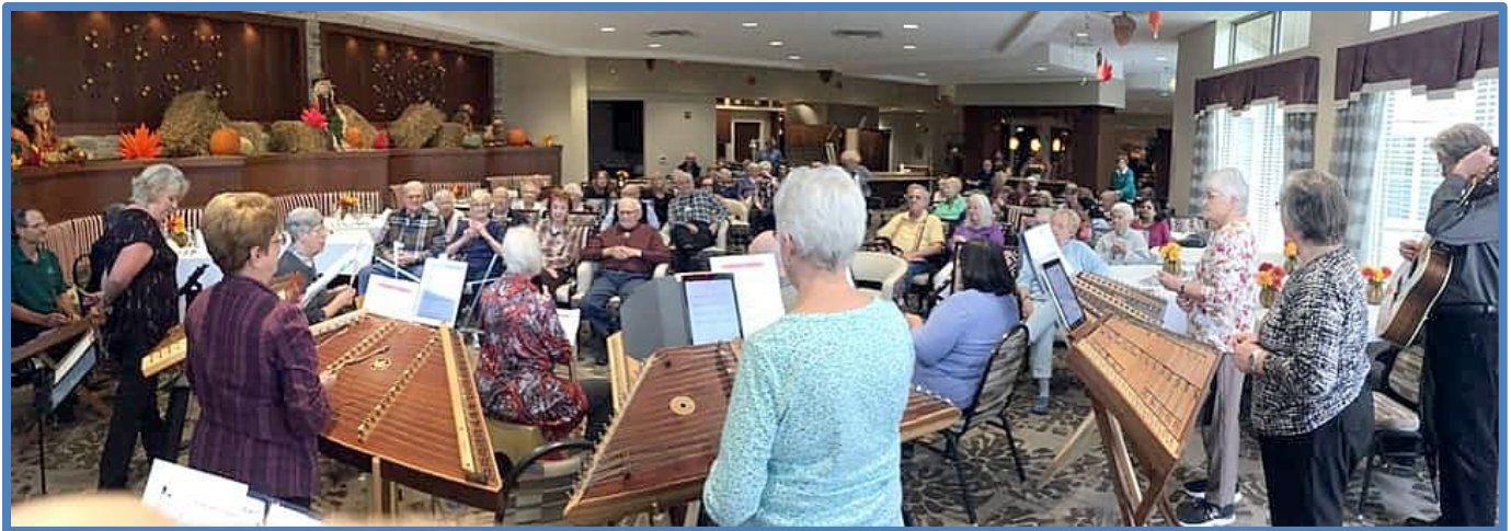
A well attended performance at Cedarbrook Senior Living in Plymouth on October 12 th