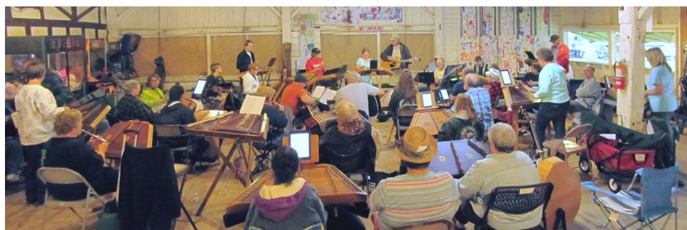
Many musicians and listeners attended jams in the barn on Friday and Saturday evenings