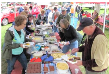
Saturday evening dinner was well attended and brought everyone together