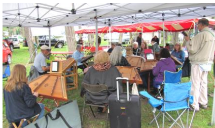
Lively afternoon jamming under the canopies