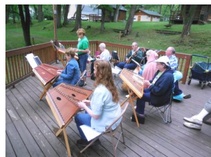
The campout was brought to a close as several musicians provided music for the Sunday morning church service by the lake.