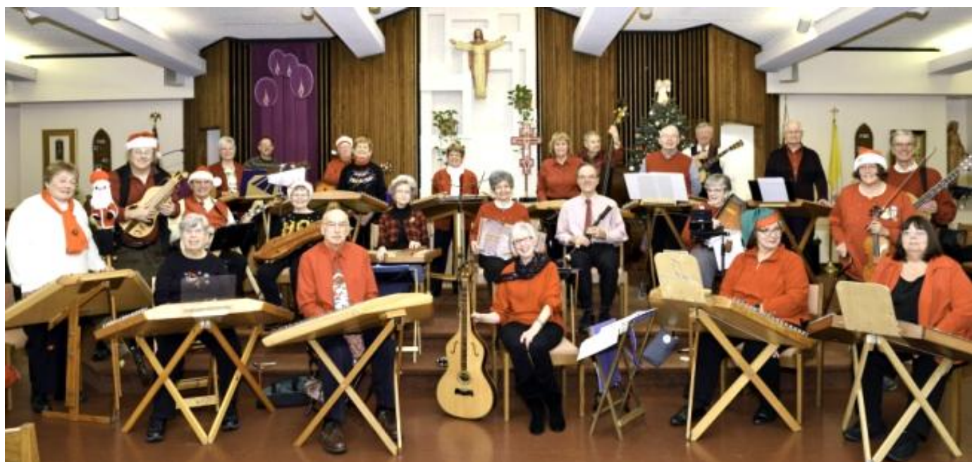
25 musicians performed to a large gathering at St. Richards Church on December 10 th Everyone enjoyed an afternoon of Holiday music and a Christmas cookie reception afterwards