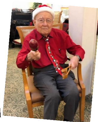
Holiday concert number 12 and our club is still smiling, at Brookdale Senior Living on December 19 th