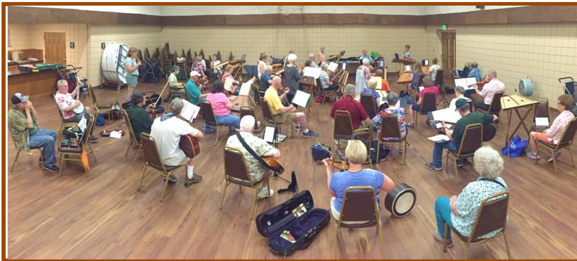
42 members showed up to jam and socialize at our July 5 th meeting.