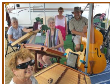
Jamming under the canopy