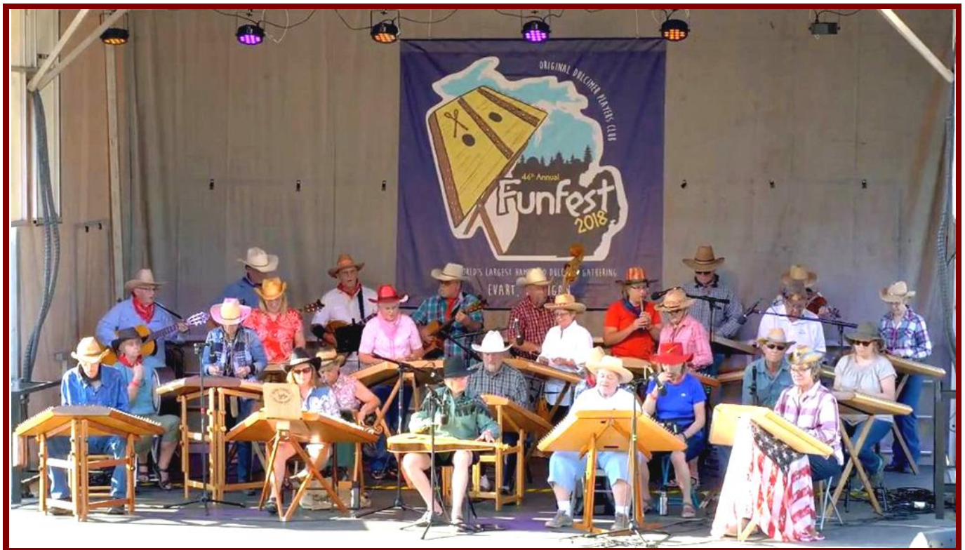
On July 19 th , 27 Silver Stringers packed the Main Stage and wowed the crowd at the Evert Funfest. Black Nag - Flowers of Edinburgh - Bard of Armagh - Rakes of Mallow - Single Footed Horse