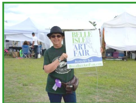
Silver Strings performed at the Belle Isle Art Fair on August 5th

WTUG 3rd Annual Ukulele Festival Saturday September 16, 2017 9am - 4pm Waterford Community of Christ 1990 Crescent Lake Road, Waterford, MI