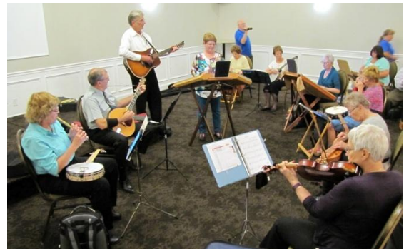
A full evening of food, music and socializing ended with our own upbeat jam. What a fun time we all had!