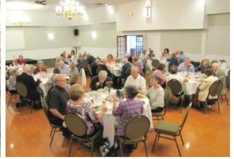
O'Kelly Banquet Hall in Dearborn hosted our Annual Banquet on October 5th, 2017