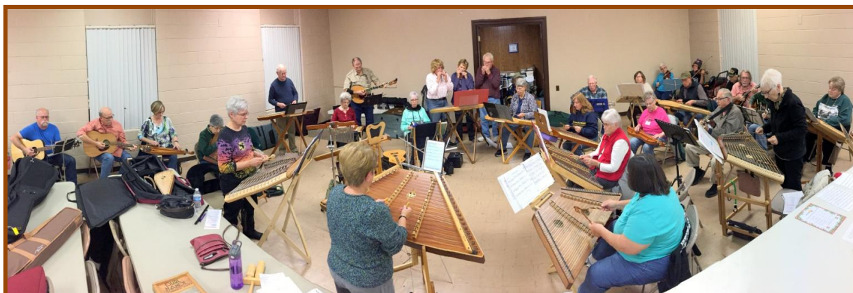
Our second well attended Holiday Music Practice took place on October 26 th