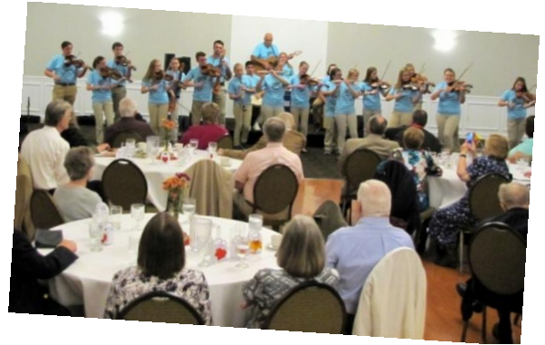
The Chelsea House Orchestra entertained with toe tapping tunes