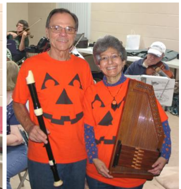
At the October 19th meeting a few members were brave enough to wear their Halloween outfits