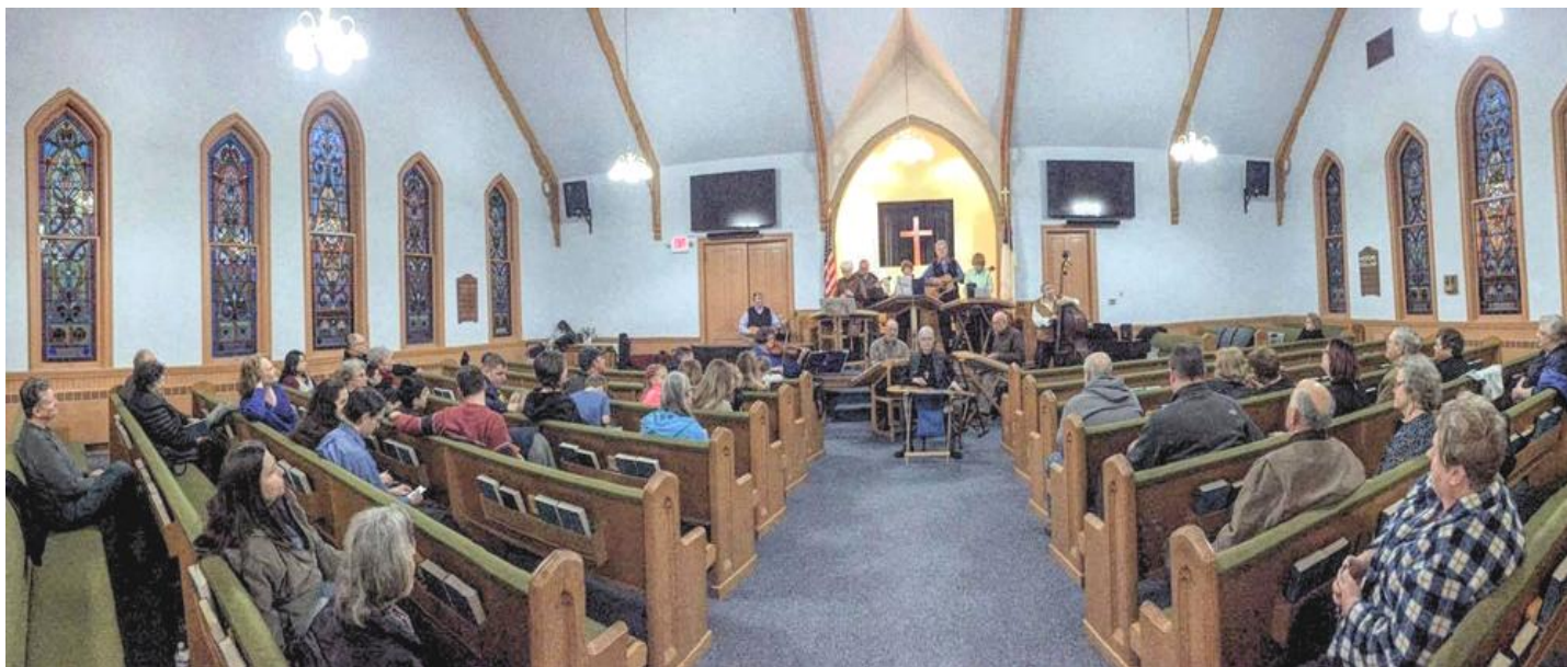
On March 31 Silver Strings performed at Salem Bible Church in Salem