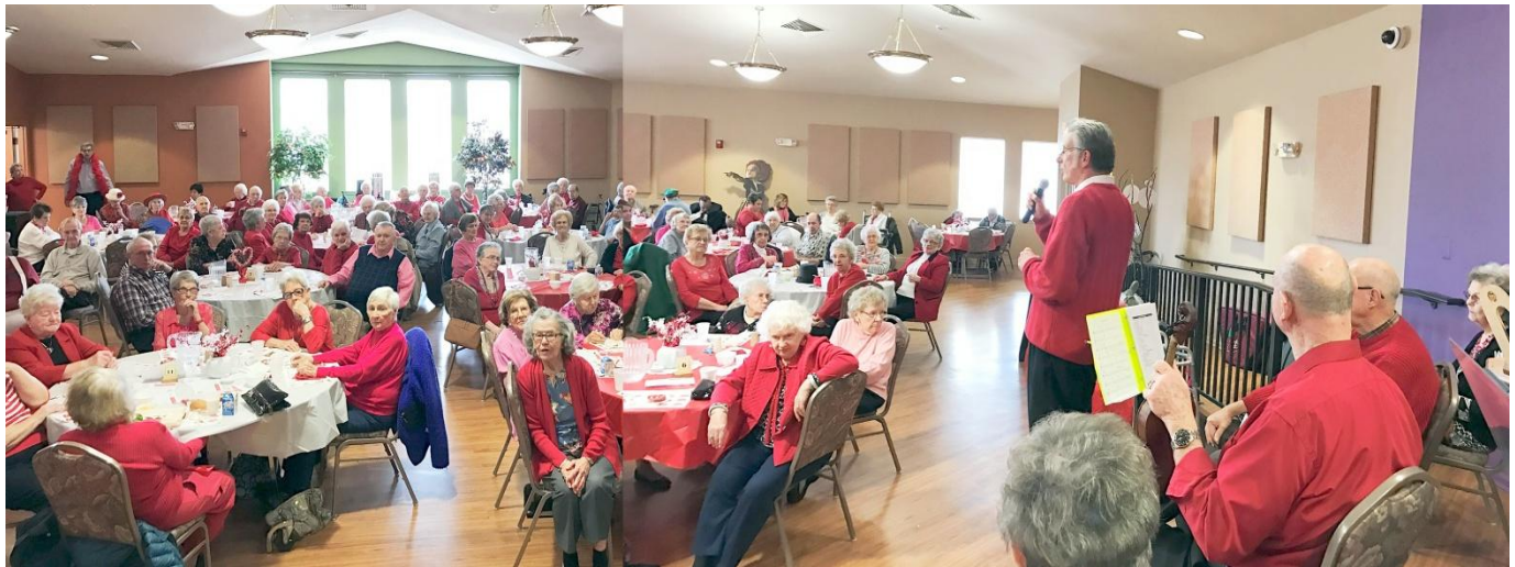
Silver Strings performed for a large crowd on February 14th at Meadowbrook Commons in Novi