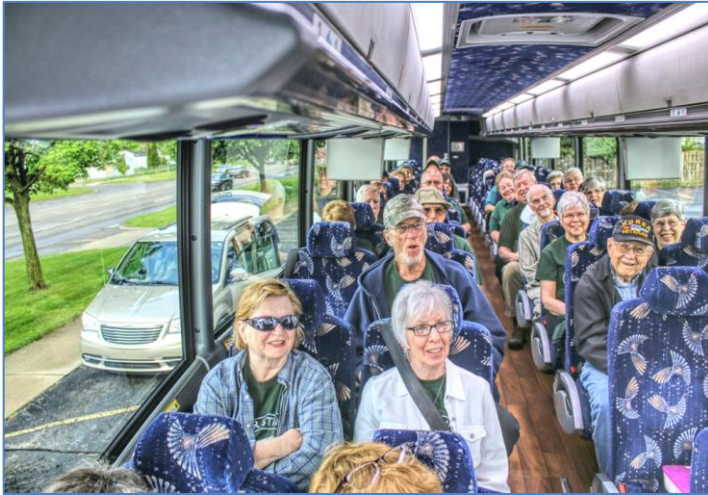
Packed up and ready for the bus trip to Lansing