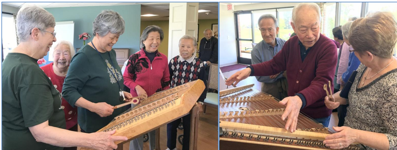
Demonstrating the Dulcimers after the concert at Parkway Meadows in Ann Arbor on May 12 th brought out lots of smiles.