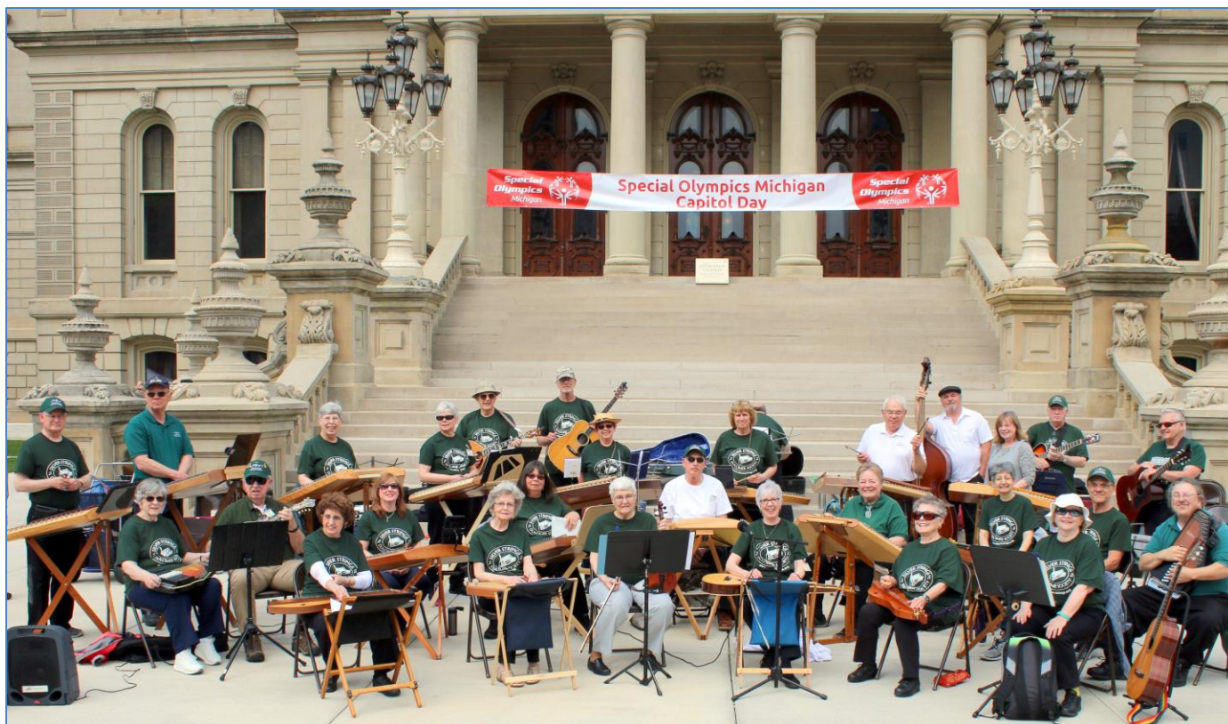
Silver Strings members getting ready to perform a one hour concert on the Lansing Capitol steps