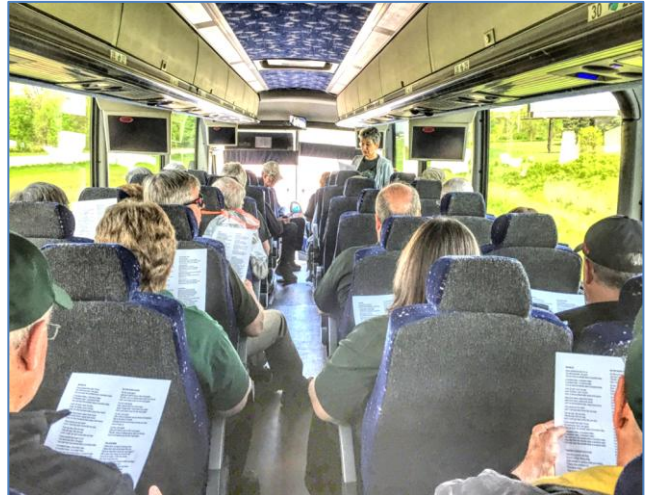
Theresa leads a sing-along as we roll-along