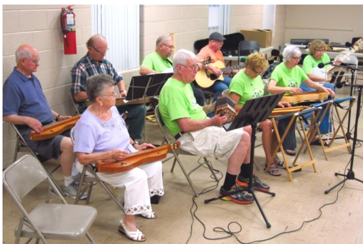
The mountaineers entertained with toe tapping tunes