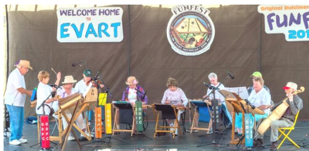
The Classical Group on stage in 2016

Also, the classical group will play at open mike on Saturday, and the tentative time is 1:30 p.m. If you are not in the group or in a class, come and listen.