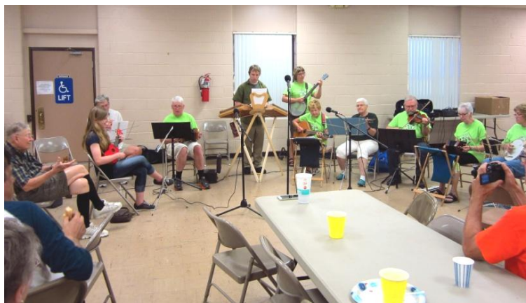
The "Turtle Jam" had everyone on a new instrument