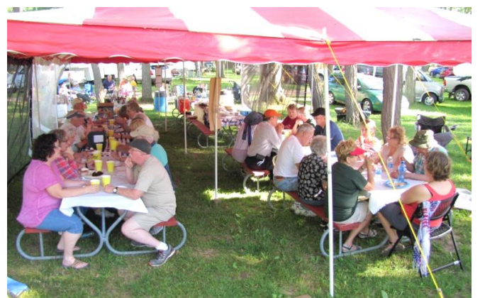
We all looked forward to the potluck dinner, after a full day of beautiful weather, workshops, jams, visiting with friends and enjoying the fresh air.