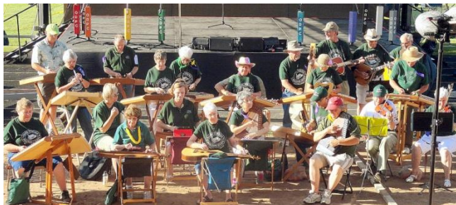
Silver Strings performance at the Funfest in 2016

The big event in July is the Evert Dulcimer Festival. Many of us will be there for some length of time. Silver Strings is playing part of the pre-show at 6:40 p.m. on Thurs. Dress will be white "shirts", dark bottoms. The theme is the Blue's Brothers so wearing a fedora and adding a black tie and dark sunglasses at the end will add visual fun. We will practice Wednesday at 5:30 and Thursday at 5:30 under the canopy behind the ODPC office. If you are performing, please be there ready to practice.