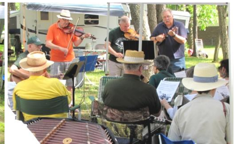
Ernie & Friends were a hit with an easy all instrument jam & sing along