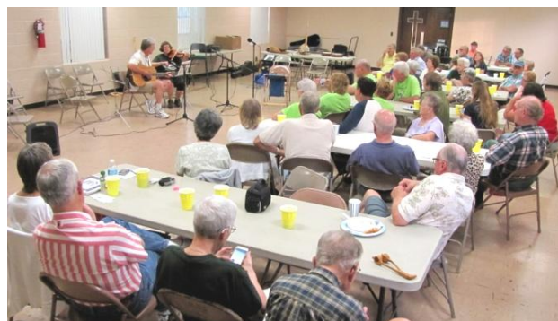
A well attended and entertaining evening