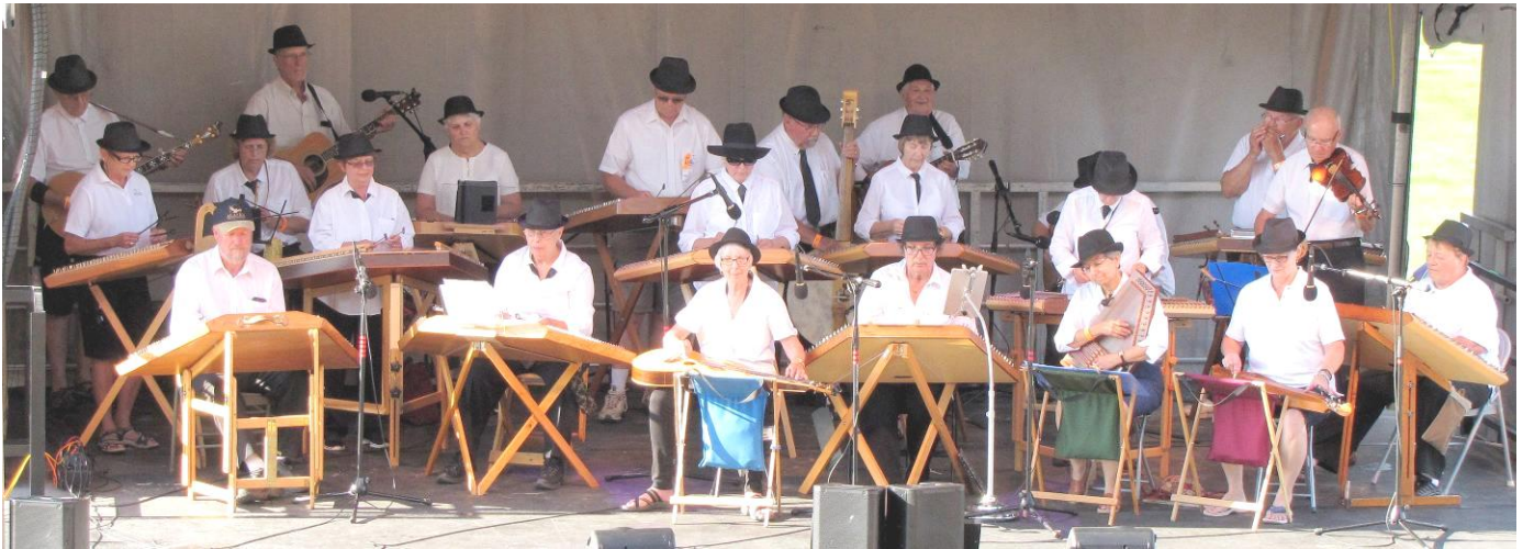
22 Silver Strings members performed at the Thursday evening concert Hangman's Reel, Livet I Finskogarna, Jig For A Sunny Day, Bucket Man Blues and Sweet Georgia Brown