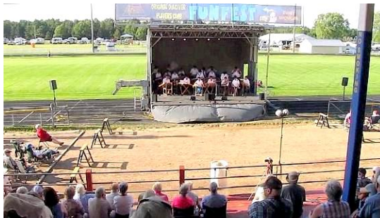
Nice weather and a happy crowd