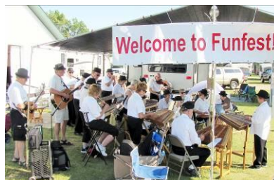
Practice for the Thursday jam