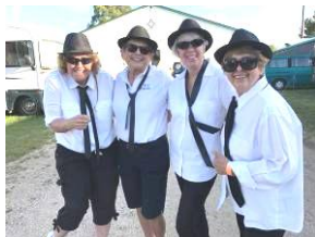
The Blues Sisters