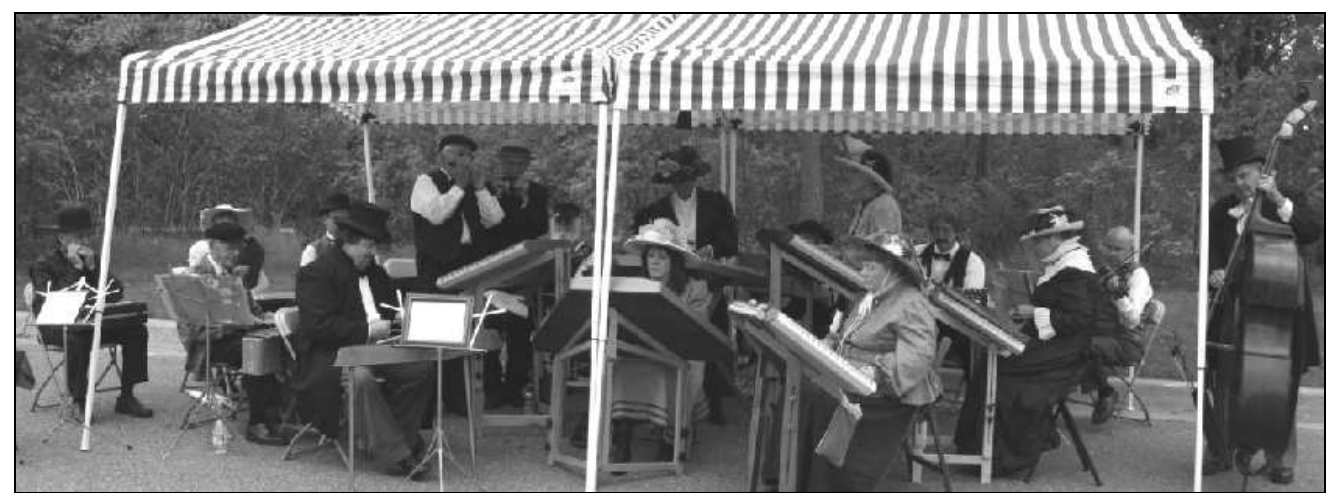
18 Silver Strings players entertained in Victorian costume at the Henry Ford Estate for the 100<sup>th</sup> anniversary of the Model T