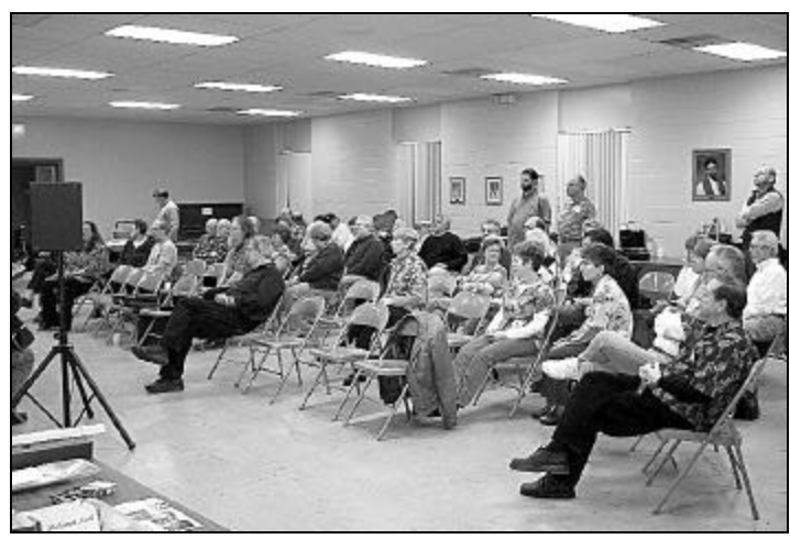
The attentive and appreciative audience