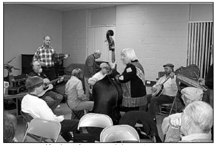
After the performance and pizza party, A music jam played the night away.

What a night of entertainment! On March 31 Silver Strings once again hosted a Variety Night, Music Swap, Pizza Party and Open Jam . There were a total of 9 acts and 23 Silver Strings members who entertained the audience for well over an hour's worth of musical variety. Mark your calendars for June 30 when once again we will offer a variety of entertainment by our own club members. So practice up a tune or two and give it a try. See you there!