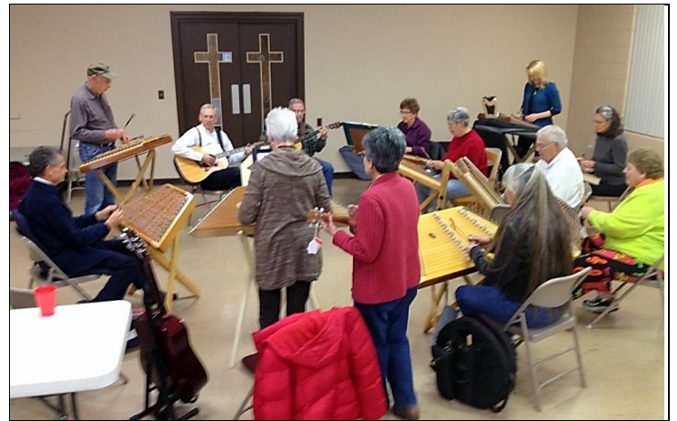
...then topped off the day with a wonderful concert.