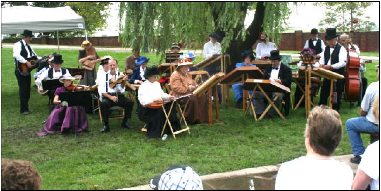
The rain didn't dampen our spirits, as we played at Greenfield Village. Costumes add to the fun.