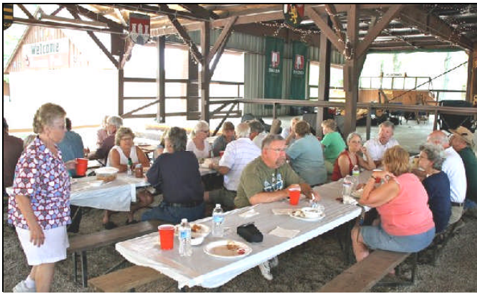
The Annual SSDS Picnic at German Park was again a huge success with great food and excellent music . The clean, modern kitchen for serving and the covered pavilion for eating & jamming insures a wonderful rain or shine fun day.