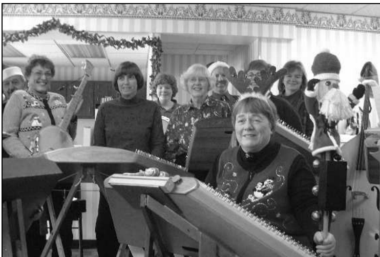
Senior living centers are always fun. Garden City Towers again provided a great audience for our music.

Over 50 churches were represented as about 175 volunteers gave their time & resources to cook & serve dinner for about 300 guests in a beautifully decorated hall. What a joyful way to spend Christmas Day !!!