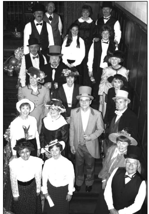
In Victorian attire, we provided dinner music to guests at the Henry Ford Estate. We were later treated to a private tour of the beautiful mansion. What a grand evening it was !

December has been a very busy month, with 12 playdates between December 1 st & 18 th . The performing group has a lot of fun, often having lunch or dinner together afterward. If you haven't yet joined a playdate, come on out... there's safety in playing with numbers, and the friendships built are priceless.