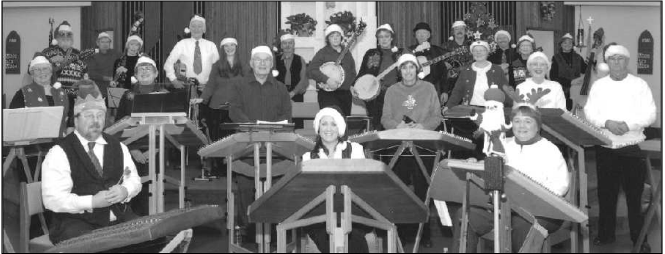
Silver Strings at St. Richard's Catholic Church in Redford... even the bass wore a Santa hat.